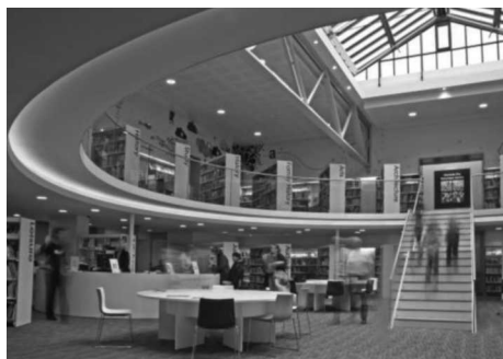
Winchester Discovery Centre