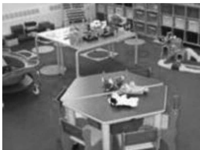
Blackburn Library crèche

centre, meeting rooms, display areas, a book shop, a family history centre etc.