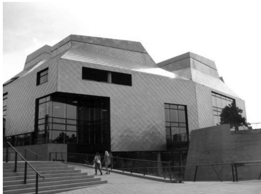
The Hive, Worcester