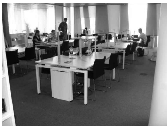
Work Area, Aberdeen University

Many of us have been brought up to see a library as, at times, a somewhat forbidding place; a great source of reading matter and information but never particularly user friendly. Everyone spoke in whispers, finding the book you wanted was not