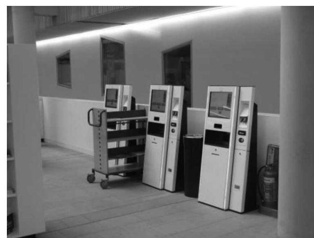
Self-service book issue and return

Stock control has been simplified with more books actually on the shelves rather than hidden away in a store room and with better access to archives and records brought together under one roof – not the situation in Hereford. Children and teen-agers have been given their own specifically designed areas, comfortable seating has been installed to allow browsing; a café and toilets are now an essential feature.