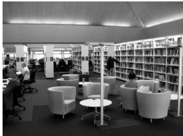
Lending Library, The Hive

“While university and public libraries may go about things in different ways, their visions and missions are quite similar. Public libraries started originally as a force for education and social good, as well as for community and social inclusion, while the earliest universities were groups of scholars congregating around libraries.