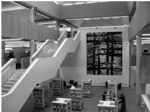
Central Atrium The Hive

Hereford Library Users' Group has, in the past few years been researching and developing its ideas and proposals for a new Herefordshire Centre that would incorporate a new central library for the city and county.