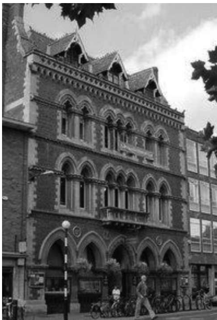
Broad Street, Hereford