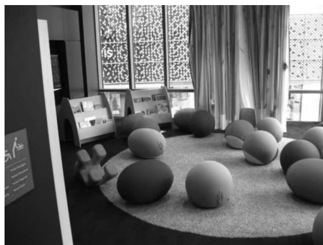
Children's area, Cardiff

These shared facilities then bring more people into the library itself; every library that has opened recently has reported increased usage with all the accompanying benefits to education, leisure and knowledge. At The Hive in Worcester In the third quarter of 2011 “a few hundred” joined the library, in the same quarter for 2012 the figure was 8,500.