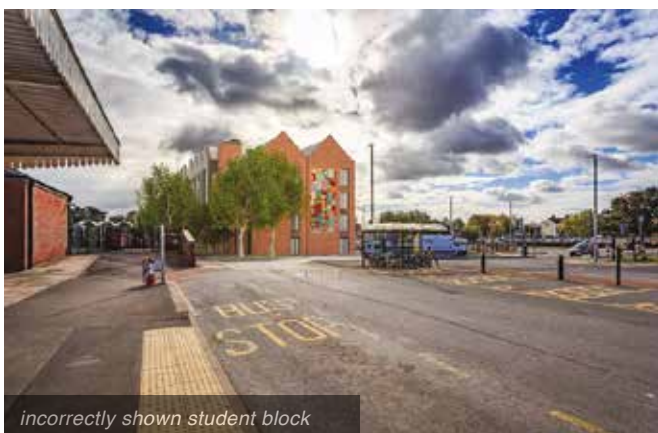
incorrectly shown student block

This proposal was first promoted in our Summer 2018 edition of PLACE, where full details of our logical route were described. In our Summer 2017 edition of PLACE, full details of the simplest way of accessing Commercial Road, High Town and the Cathedral were shown – Morrison's Gateway. Full articles available on our web site: www.herefordcivicsociety.org.uk