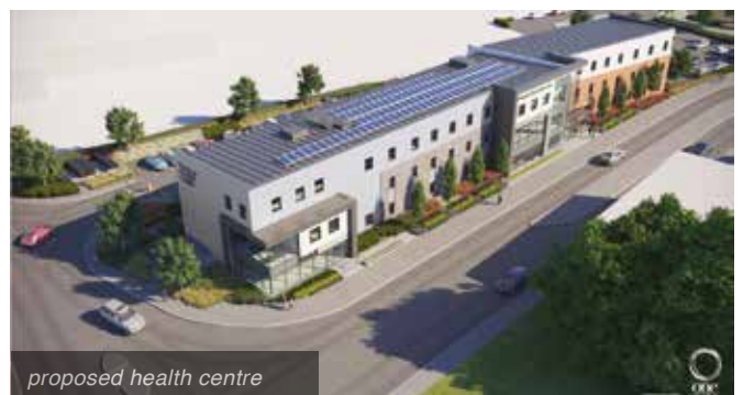
proposed health centre