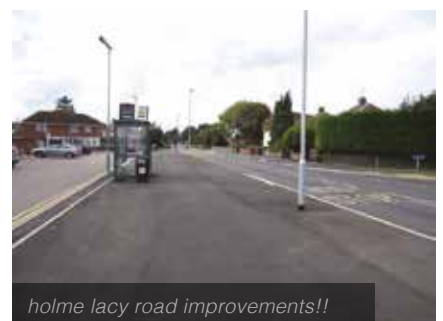
holme lacy road improvements!!