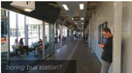
boring bus station?