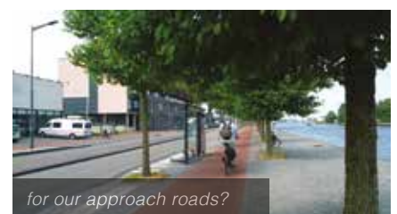
for our approach roads?