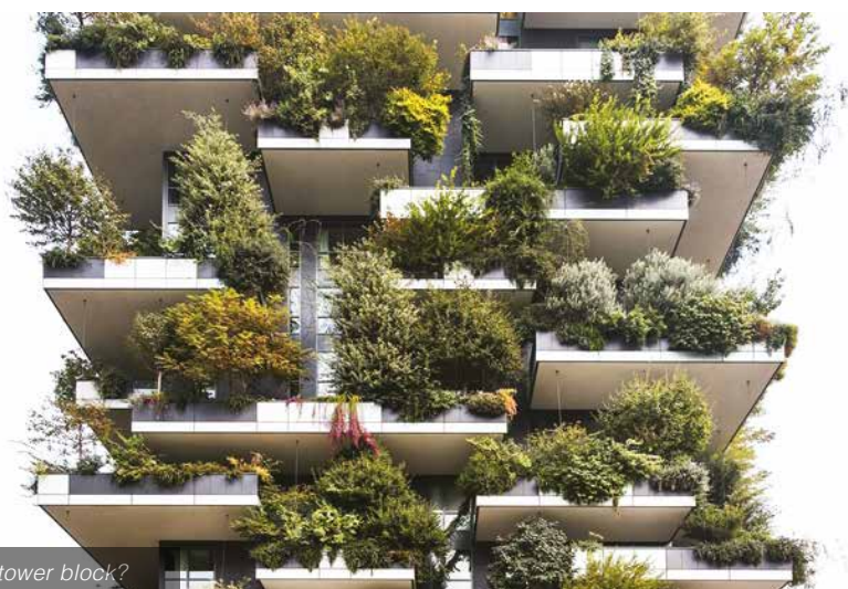
green tower block?