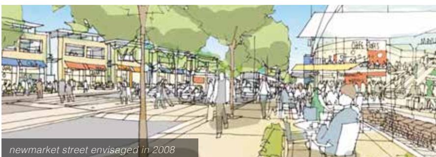
newmarket street envisaged in 2008