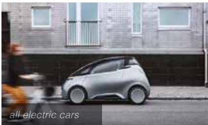
all electric cars