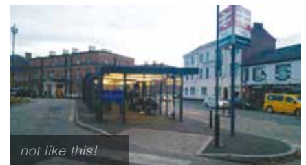
not like this!