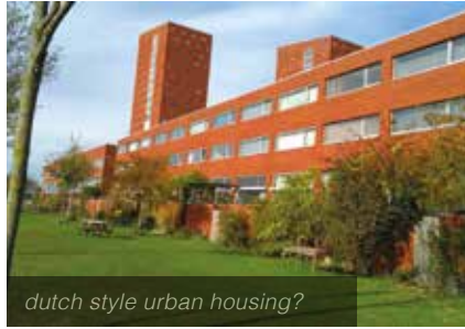
dutch style urban housing?