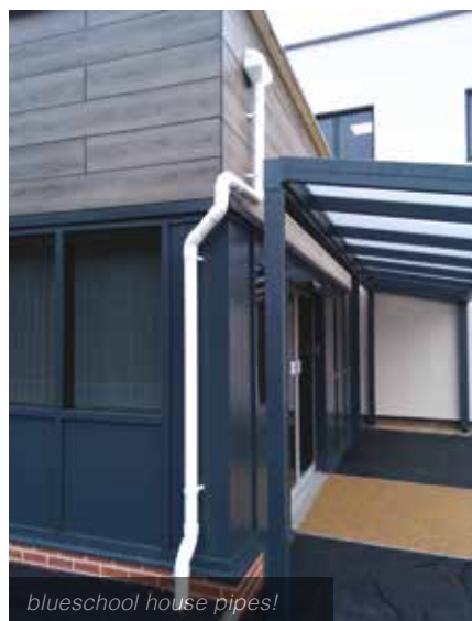
blueschool house pipes!