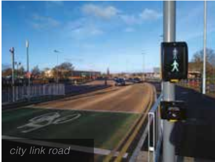
city link road