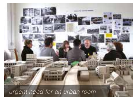
urgent need for an urban room