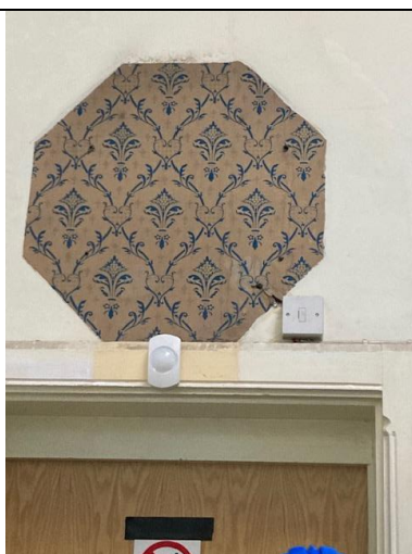
Original wallpaper outside the Woolhope Room