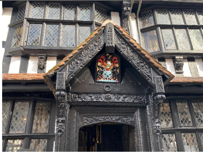
Magnificently repainted entrance