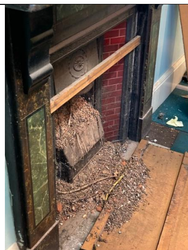
The curator's fireplace, top floor