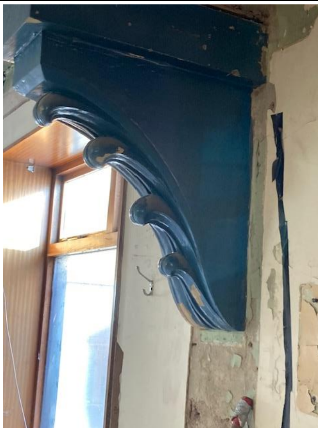
Corbels will be retained to showcase building's history