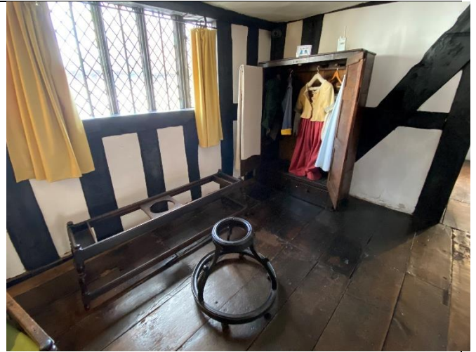
Childhood area, first floor. Dressing-up clothes are now on each floor.