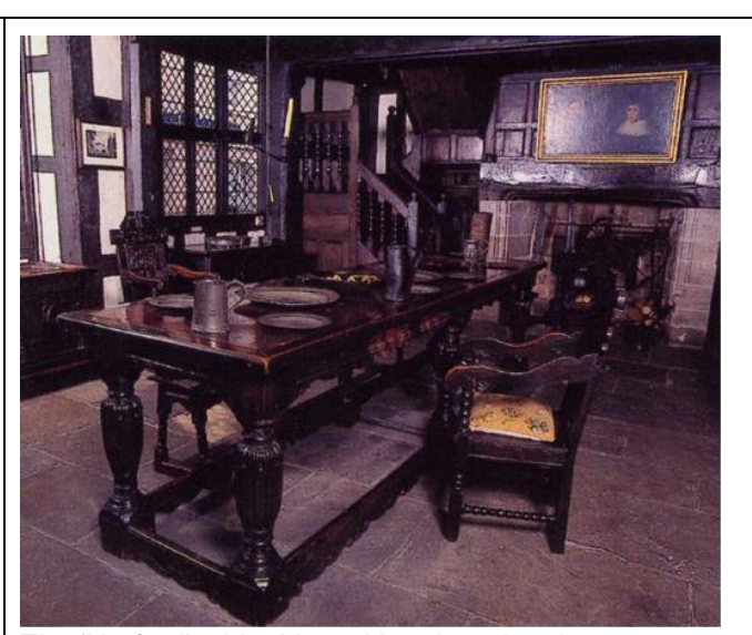
The 'Harford' table- Yew with oak and mahogany top

The strong box chest found on the ground floor is made of iron and would have been used to store valuables such as gold and silver items, documents, money or even spices. It is notable for an elaborate locking mechanism. The lock plate on the front is not functional but decorative, demonstrating wealth but also acting to help deceive any potential thieves. The true lock is in the lid and includes seven lock bolts with the real keyhole concealed behind a small iron plate. Four mounting points for padlocks on the front provide further security. The underside of the lid has a beautifully engraved panel made of tin, behind which sits the locking mechanism for the seven bolts. These boxes were never intended to be easy to transport, this particular example needing at least two very strong people to move even when empty. Together, the weight and elaborate locking mechanism make this one of the safest storage chests of the period.