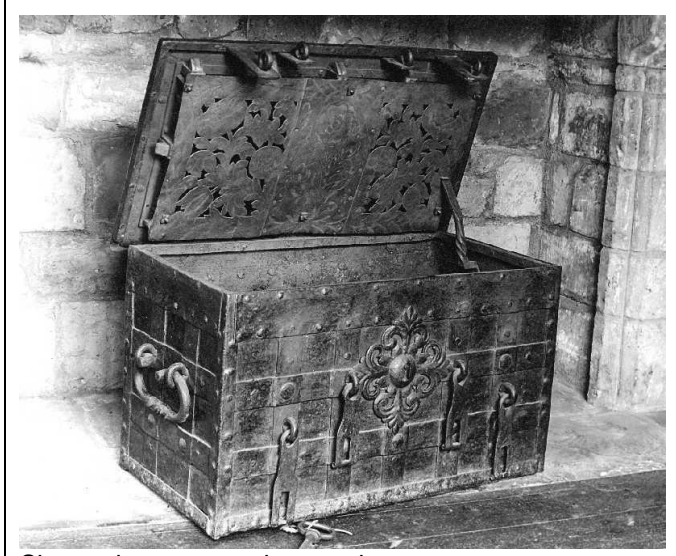
Sixteenth-century oak strongbox