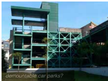
demountable car parks?

election in the 2019 local elections, the Hereford Times and the local business forums. We want the new Herefordshire Council administration and Hereford City Council to have a clear mandate to work with local enterprises to develop a City that we can all be proud of.