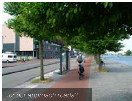
for our approach roads?