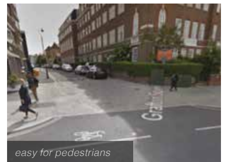
easy for pedestrians